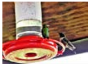
Alicia Stankay "Hummingbirds Discuss Covid-19"