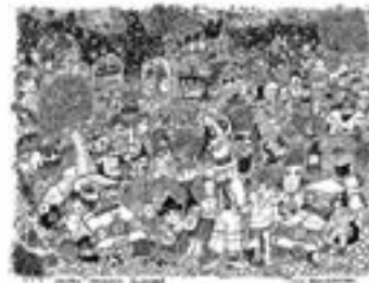
Larry Brandstetter "Bamboozle Boulevard"